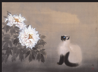
Matazo Kayama <A Cat> 1976

*The exhibited works are subject to change.