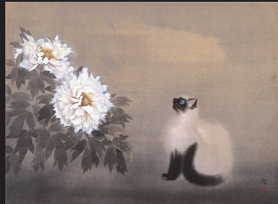
Matazo Kayama <A Cat> 1976

*The exhibited works are subject to change.