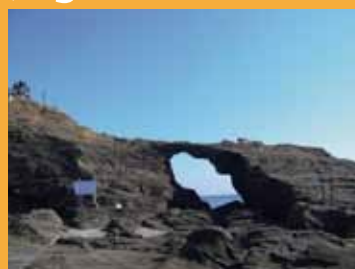
The photograph "Horseback Cave"

This place received a two-star rating in the third edition of the Michelin Green Guide Japan. To the west, you can see Mt. Fuji from across the Bay of Sagami. From the hiking courses to the north, you can view the magnificence of the Pacific Ocean through the "Horseback Cave" rock formation.