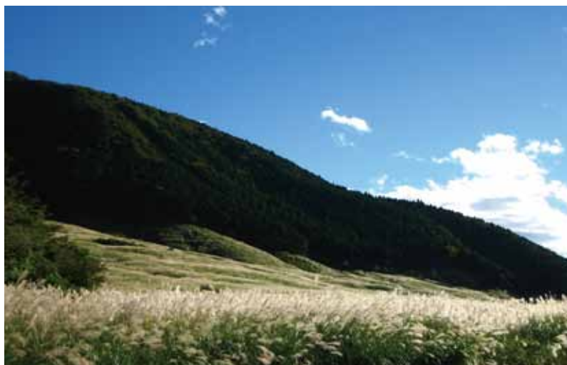
From the end of September to the beginning of November, the tops of the grass turn a golden color, turning the mountainside into a beautiful scene - a sign of Autumn at Sengokuhara.