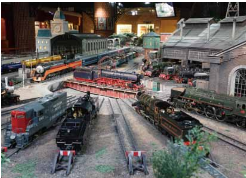
A variety of model trains and railway collectibles, said to be the largest such collection in the world, are on display.