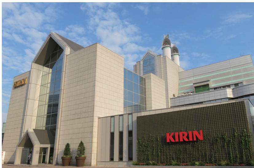
There are restaurants located within the factory.