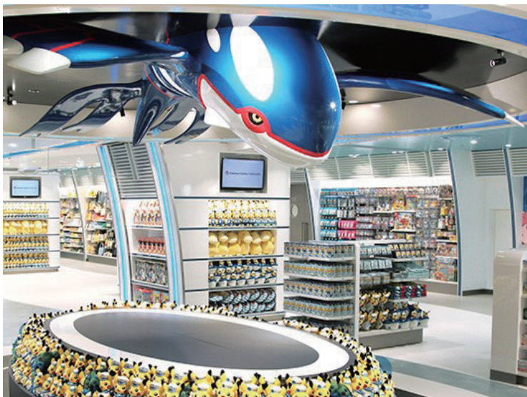
©2020 Pokémon. ©1995-2020 Nintendo/Creatures Inc. /GAME FREAK inc. Pocket Monster, Pokémon, Pokemon is an official registered brand of Nintendo, Creatures, and Game Freak.