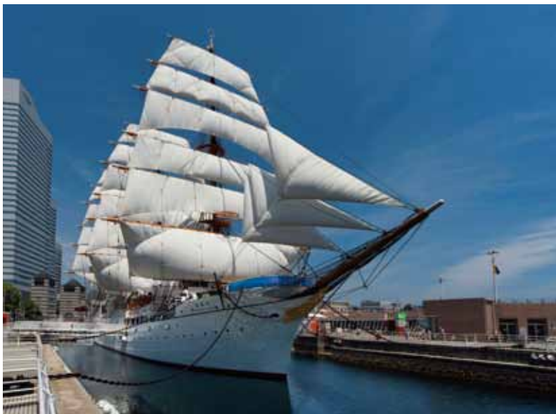
The full sail exhibition sail which opens all sail about 12 times a year