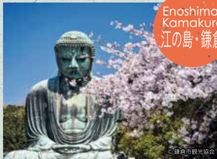
Enoshima/ Kamakura 江の島・鎌倉

A wonderful view of Mt. Fuji, the lake, and Hakone Shrine is visible from a sightseeing boat.